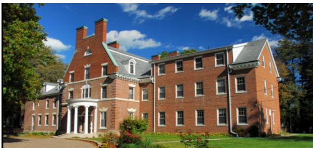
St. Joseph Retreat House, Milton, MA

In between each session, students will engage in the ministry of direction, with the accompaniment of an approved supervisor.